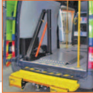
Rear door box section frame with alloy top

The unique folding action of this lift means It can be stowed without obstructing access and with minimal impact on the vehicle's payload. We often collaborate with our customers to develop industry specific lifts, this version has been adapted specifically to handle oil barrels.