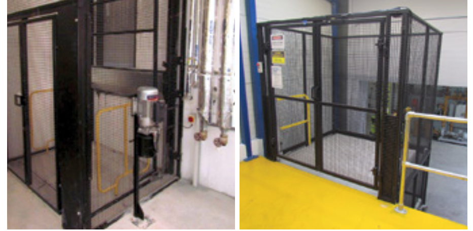
Fully Guarded design